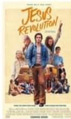
Based on a true story, starring Kelsey Grammer

'Jesus Revolution' review: Emotionally powerful film highlights how God uses broken people to bring revival